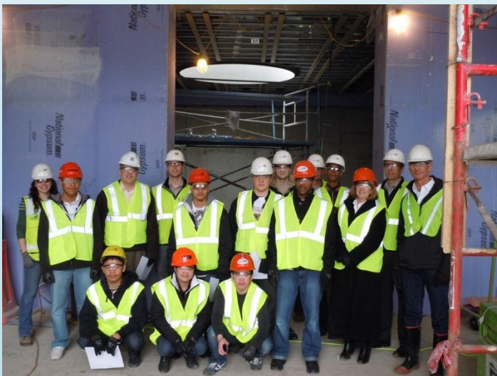
Students and mentors posing after a tour and scavenger hunt at the Lakewood Mausoleum project site.