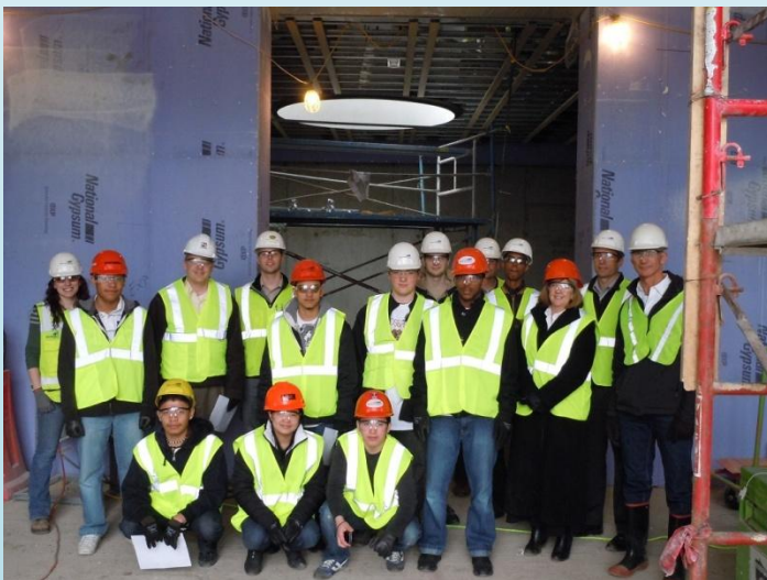
Students and mentors posing after a tour and scavenger hunt at the Lakewood Mausoleum project site.