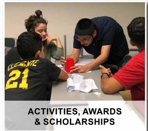
ACTIVITIES, AWARDS & SCHOLARSHIPS