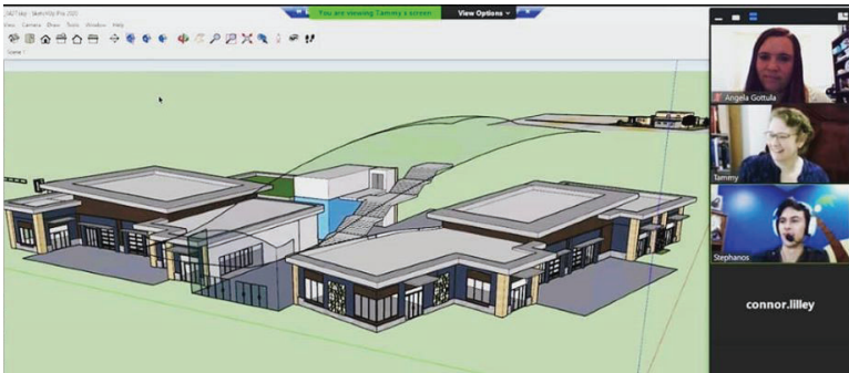
Finishing out the year on Zoom