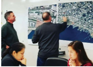
Site planning & design