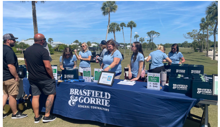
Brasfield & Gorrie Cowford Invitational Golf Tournament on April 8, 2024.