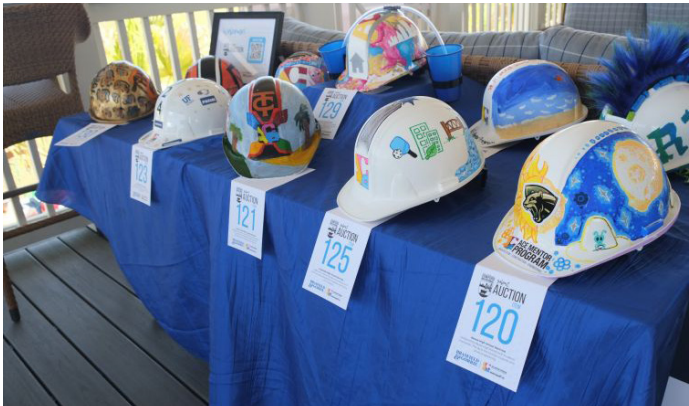
ACE Students from each school decorated hard hats that were auctioned at the Brasfield & Gorrie Cowford Invitational Silent Auction.