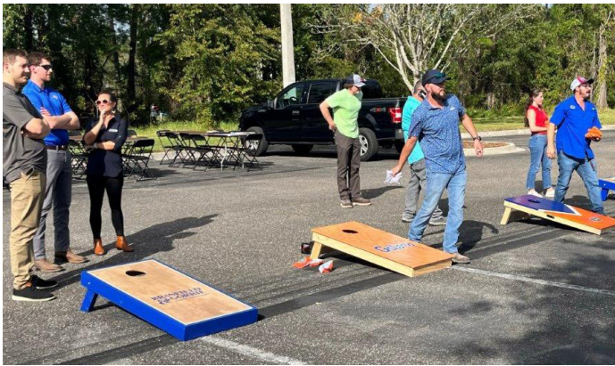
Brasfield & Gorrie Cornhole Tournament, Impact Week 2023

ACE Mentor Program of Northeast Florida was selected as the Brasfield & Gorrie primary fundraising beneficiary for the years 2024-2026. The partnership kicked off during Impact Week in October 2023, where a Cornhole fundraising initiative resulted in $33,000 of donations pledged to ACE NEFL. Brasfield & Gorrie also hosted their Annual Cowford Invitational golf tournament and the ACE Mentor Program was the beneficiary, receiving an additional $95,000 in funding. This is an extraordinary opportunity for ACE to fortify and expand our program to benefit the youth of Northeast Florida.