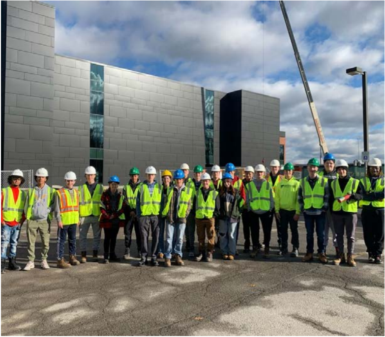
UR LASER LAB - LECHASE CONSTRUCTION