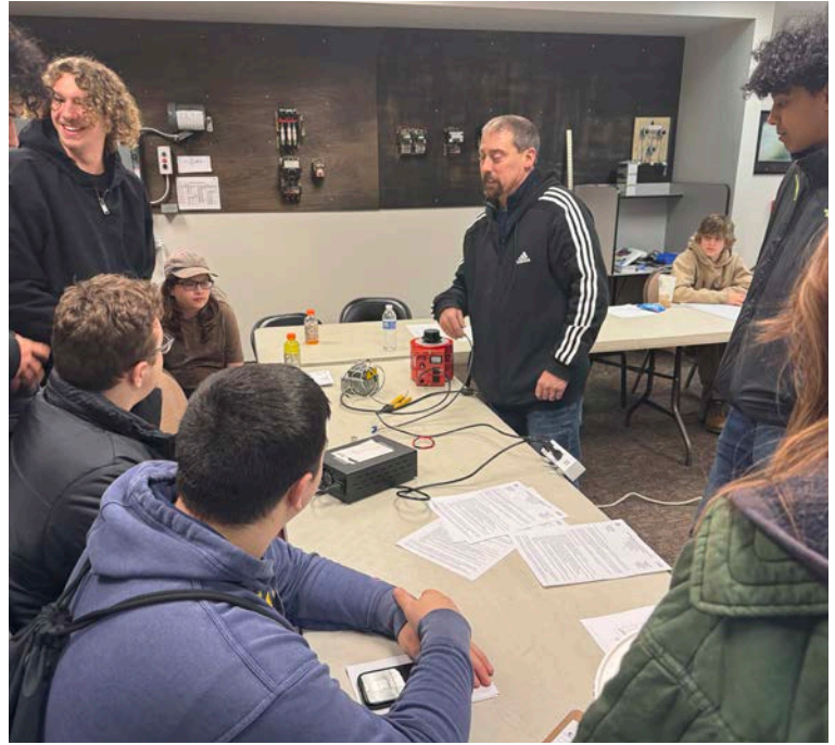
ELECTRICAL CONSTRUCTION - NECA TRAINING FACILITY