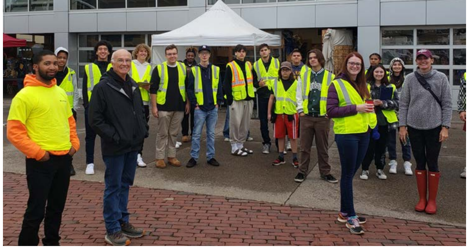
ROCHESTER PUBLIC MARKET - CITY OF ROCHESTER