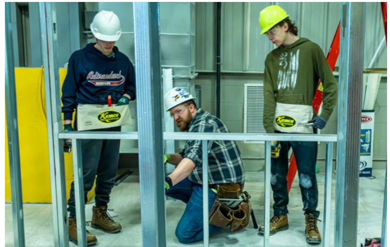
METAL STUD FRAMING COMPETITION - LOCAL UNION 276