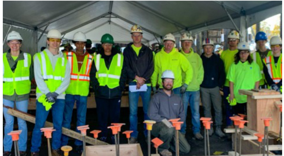
CONCRETE FOOTING COMPETITION - PIKE CONSTRUCTION SERVICES