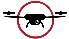
Building Information Modeling