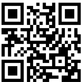
ACE Mentor Registration