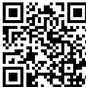
CMS Volunteer Registration